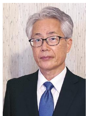
Ambassador Satoshi Suzuki of Japan

"Italy is an important strategic partner for Japan because we share the same fundamental values. Cooperation between Italy and Japan is crucial not only bilaterally, but also for the resolution of various challenges facing the international community,